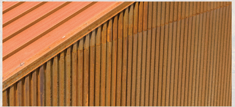
Redfox Commons, Portland, OR Featuring 16" MS200™ Roof Panels & Custom Contour Series™ Wall Panels