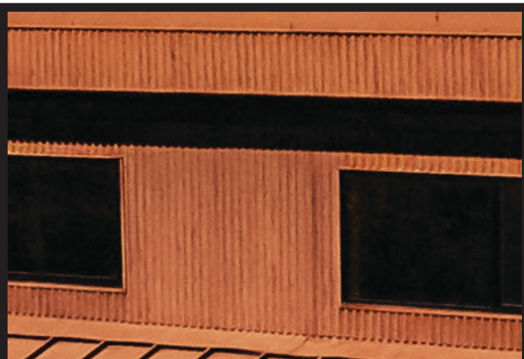
Adante Winery, Dallas, OR Featuring 18" MS200™ Roof Panels & Classic 7/8" Corrugated™ Wall Panels