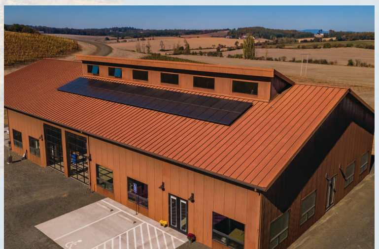
Adante Winery, Dallas, OR Featuring 18" MS200™ Roof Panels & Classic 7/8" Corrugated™ Wall Panels

This atmospheric corrosion resistant steel was developed to be used where higher strength and longer life cycle material were desired than with cold-rolled steel.